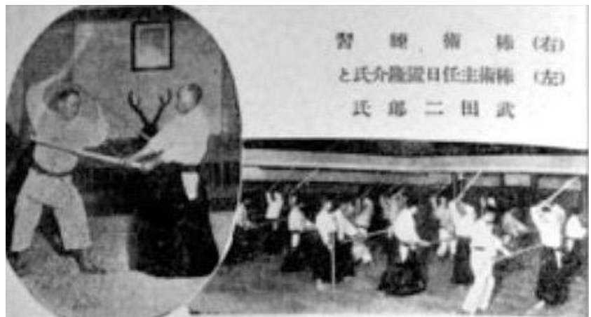
One of the few photographs that exist on the Kobudo Kenkyukai